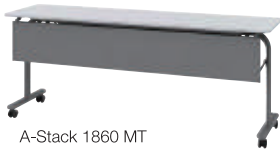
A-Stack 1860 MT