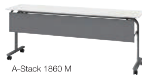
A-Stack 1860 M