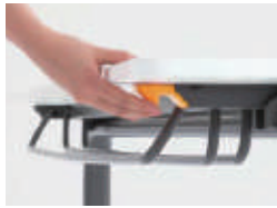
One touch operation