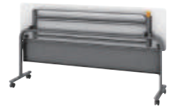
Effective use of space