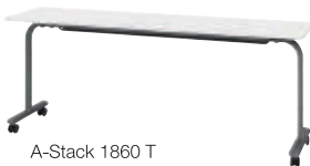
A-Stack 1860 T