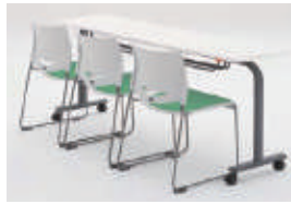
Wide space between each legs

A-Stack is basic and standard folding table. This table helps to make effective use of space.